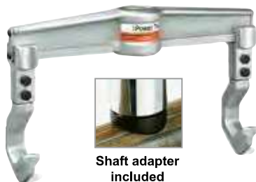
Shaft adapter included

Good for straightening mechanical shafts, round bars, etc. Simply remove pump and cylinder from puller head and insert them into the straightening tool accessory. This product is widely used in steel mills, wire roll companies, wire extruding companies, textile industry, and any straightening situation where portability and power are required. Contoured heat-treated shaft adapter included.